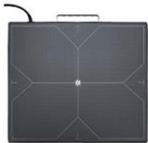
14 x 17" Tethered Detector