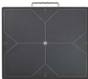
14 x 17" Wireless Detector

Wireless Only: Dual-band wireless acquisition and transfer of a full resolution image in ~4 seconds. All wireless panels come with extra-long battery life and Standard Gigabit Ethernet port for optional wired operation.