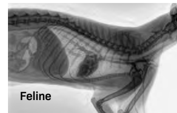
Fluoroscopy Sample Image