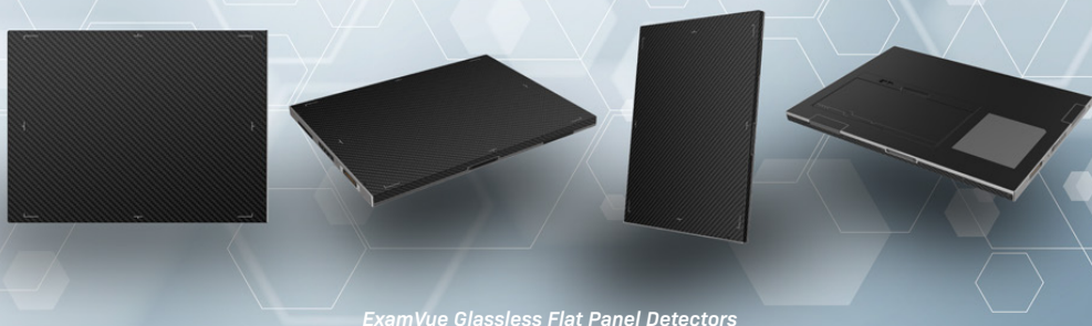
ExamVue Glassless Flat Panel Detectors