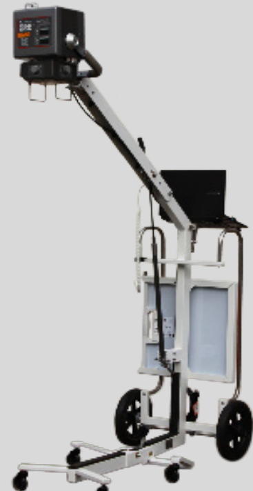
Unfold and be ready to take an X-ray immediately