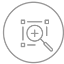
Patient Positioning Guides