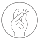
Easy to Use and Learn